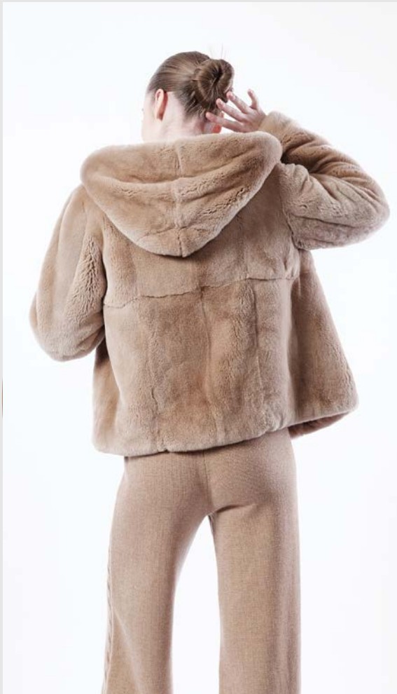
ENA REX BROWN