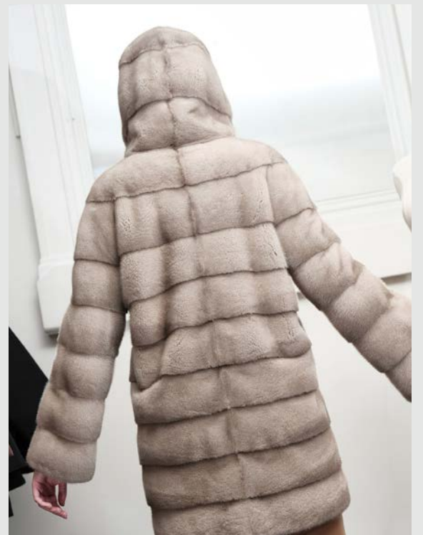
ANGE LONG VISON/SILVERBLUE