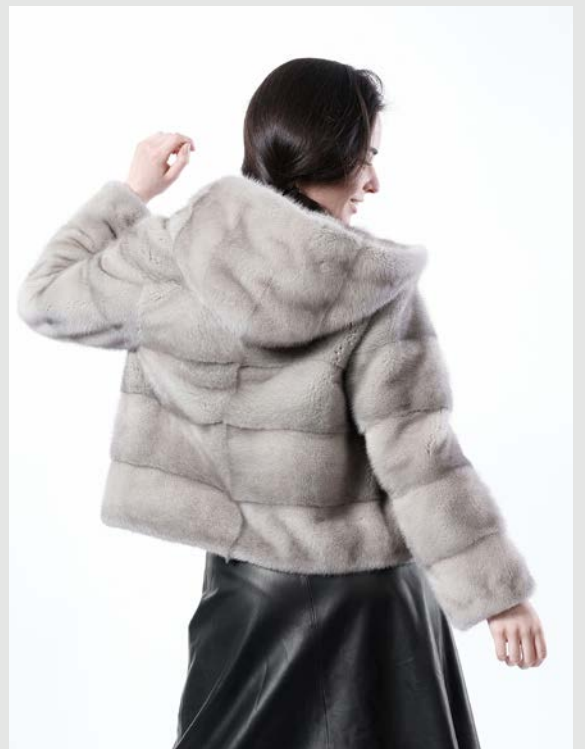
LENNY CAPUCHE VISON/SILVERBLUE