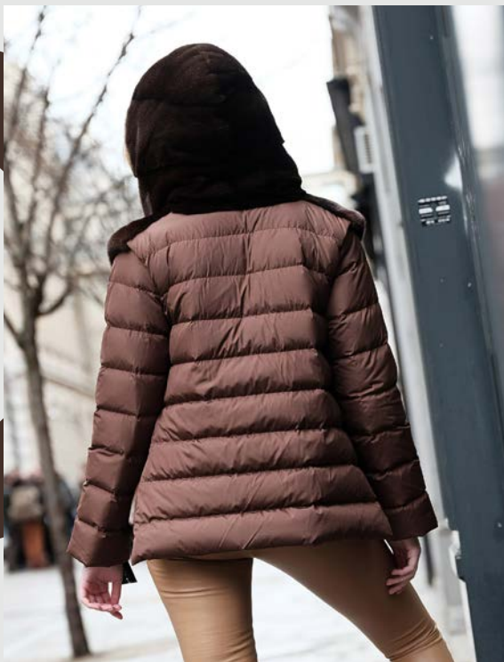
7603 VISON/POLY SCANBROWN