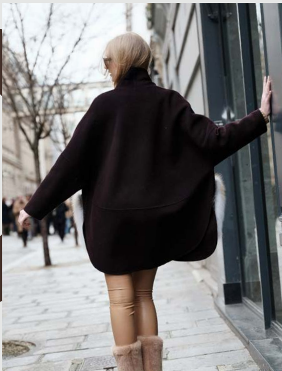
MX2421 LAINE/CASHEMIRE MARRON