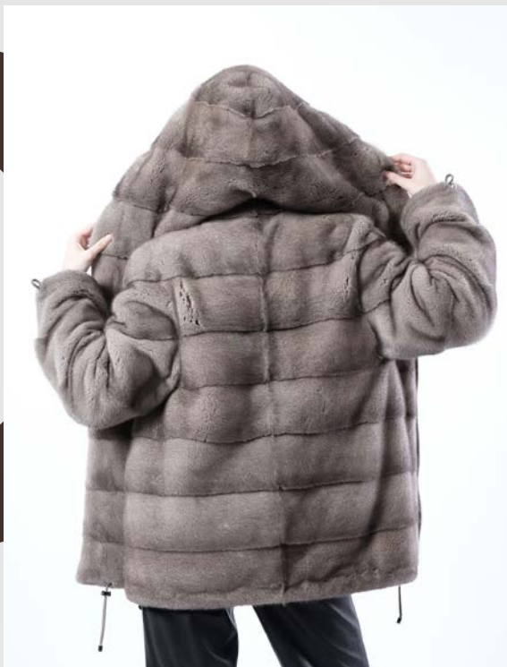
JOHAN ZIP VISON/SILVERBLUE