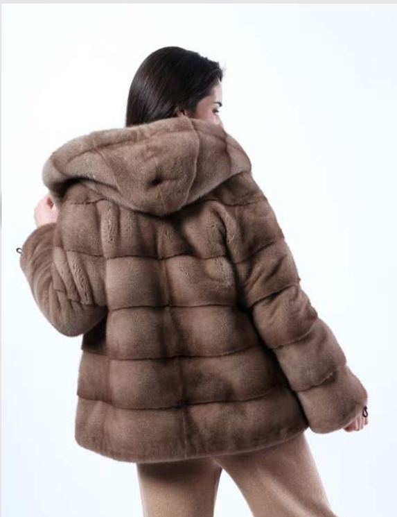
JOHAN-ZIP VISON PASTEL