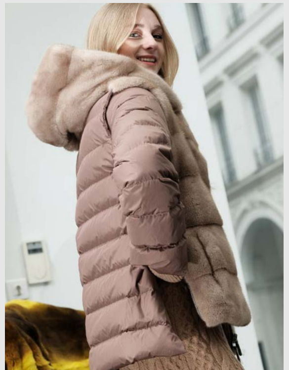
7603 VISON/POLY PASTEL