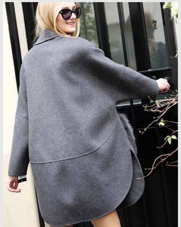
MX2420 LAINE/CASHEMIRE GRIS