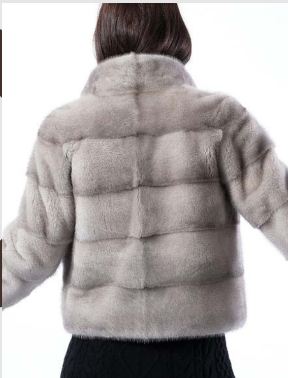
LENNY COL VISON/SILVERBLUE