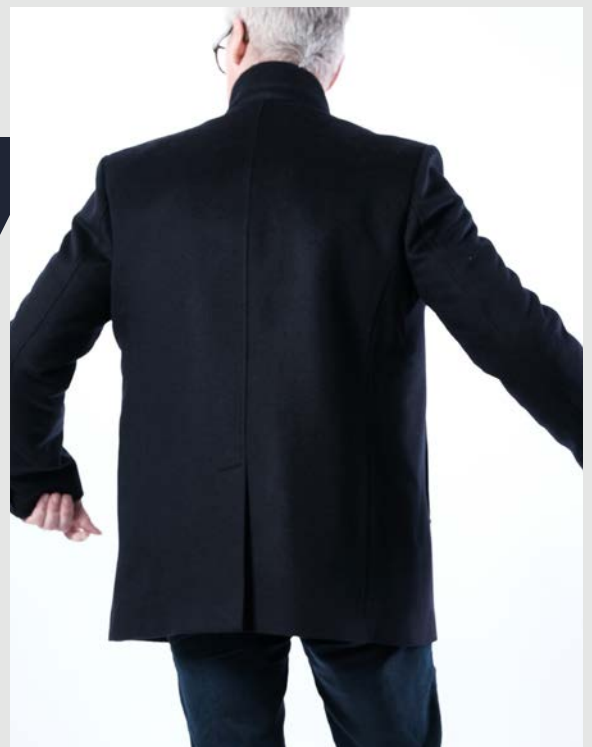
60218 LAINÉ/REX BLACK