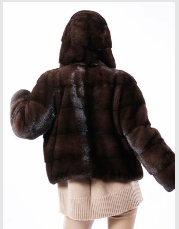
LENNY CAPUCHE VISON/MARRON