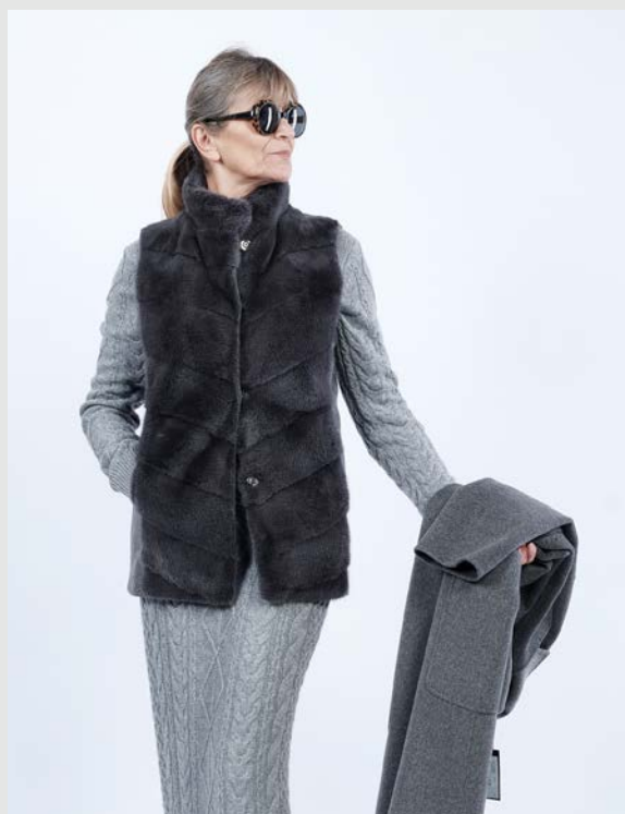
EF1929 BIS MANTEAU LAINE + GILET VISON