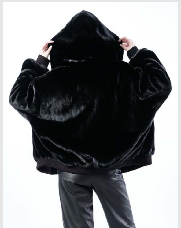
ANZ20120-2 TISSUS TECHNIQUE REVERSIBLE VISON